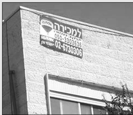
From now, sale and rental prices in shekels.

The statistics show that while between 96%-97% of rentals were stated in dollars